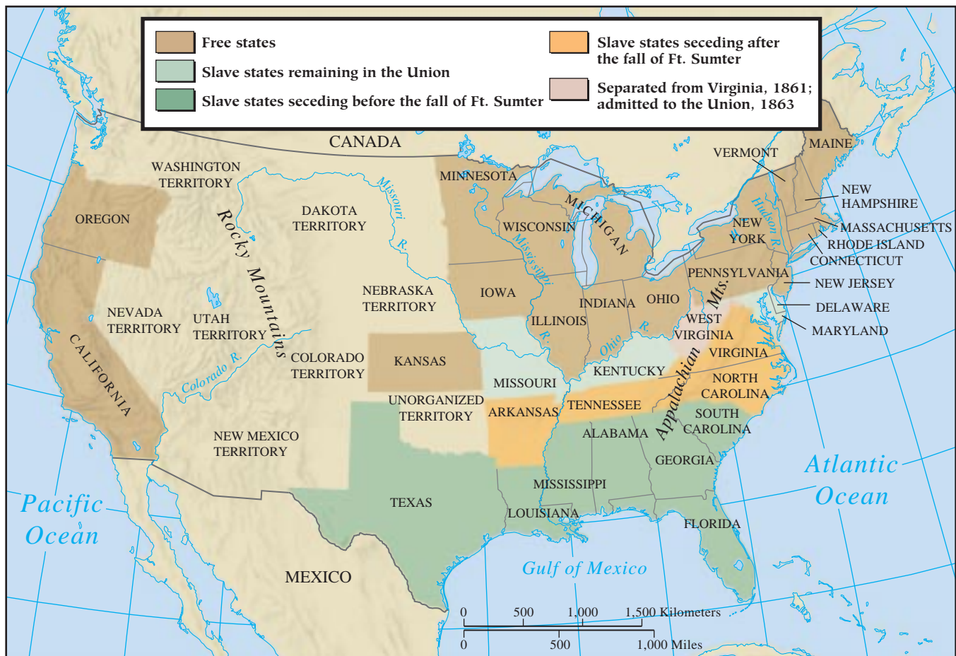
MAP 22.5 The United States: The West and Civil War.

Between 1850 and 1871, continental industrialization came of age. The innovations of the British Industrial Revolution—mechanized factory production, the use of coal, the steam engine, and the transportation revolution—all